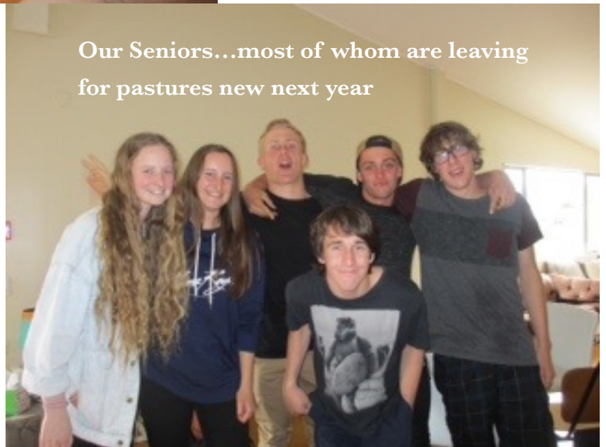
Our Seniors...most of whom are leaving for pastures new next year

A quote from Bono....."Jesus went around saying he was the Messiah, that's why He was crucified. He was crucified because He said He was the son of God. So He either was the son of God or He was nuts. And I find it hard to accept that whole millions and millions, half the earth, for 2000 years have been touched and have felt their lives touched and inspired by some nutter."