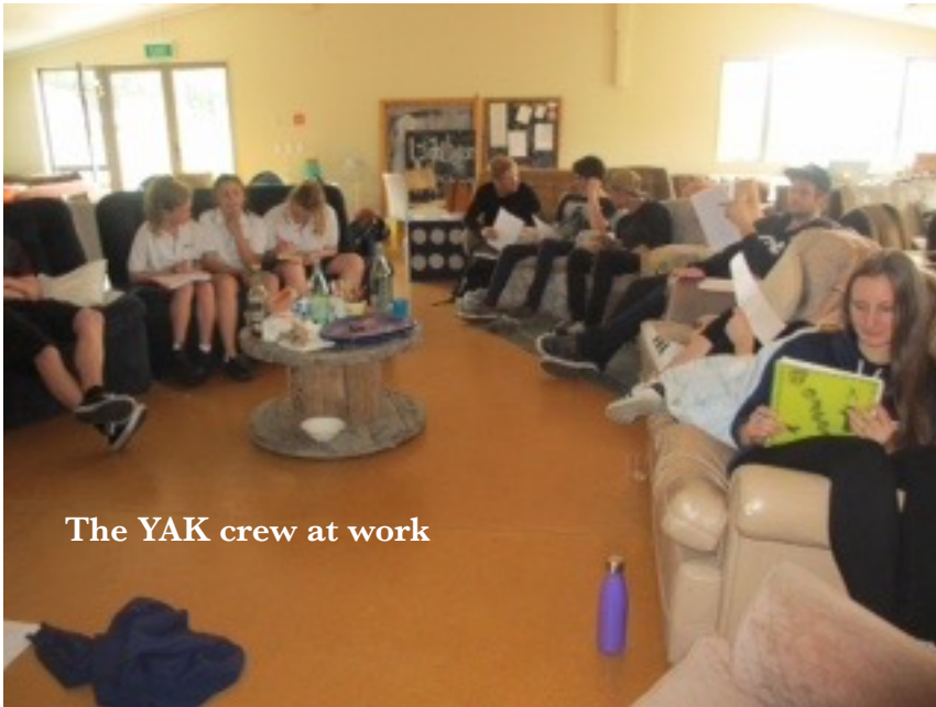
The YAK crew at work

YAK meets every Tuesday in the school term and numbers have remained constant, averaging around 15 students each week.